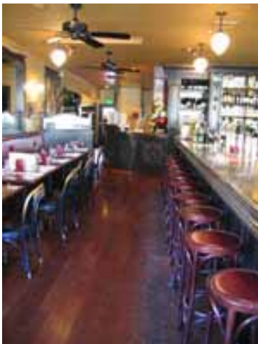
Underwood Bistro & Bar

Stella's Cafe in Sebastopol at 4550 Gravenstein Highway. Good food! http://www.stellascafe.net/