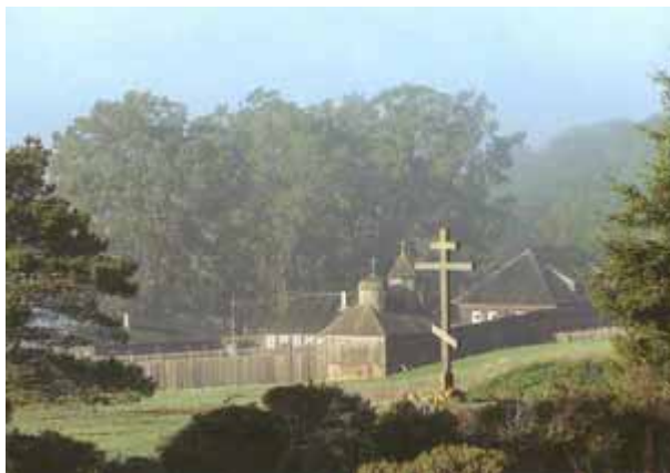
Fort Ross State Park

Fort Ross State Historic Park. 19005 Coast Highway One, Jenner, CA 95450. Fort Ross State Historic Park is one of the oldest historical park units in the California State Park System. Fort Ross is a wonderful place to visit for its outstanding scenic beauty, recreational opportunities, and to learn about local, California, or world trade history. http://www.mcn.org/1/rrparks/fortross/