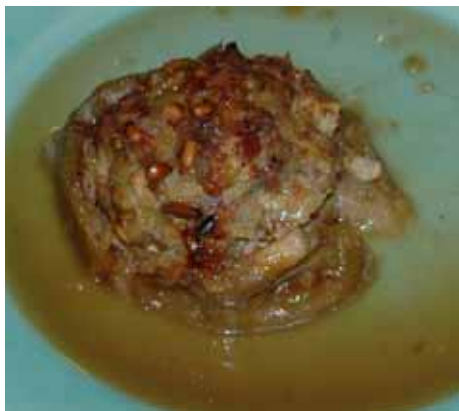
Baked Apples Stuffed with Pork, Ham, and Pine Nuts (Pomes Farcides al Forn)

This recipe for stuffed baked apples comes from The Catalan Country Kitchen by Marimar Torres. The book covers both food and wine from the Pyrenees to the Mediterranean Sea-coast of Barcelona. Marimar included more than 100 Catalan recipes in this beautiful book available from her website. http://www.marimarestate.com