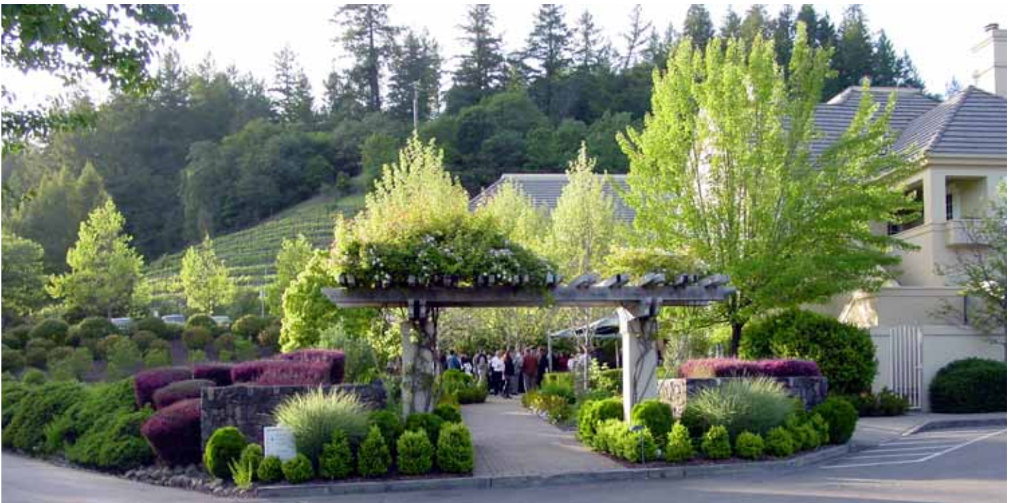
Hartford Family Wines

Other small wineries in the Green Valley area include: Dutch Bill Creek Winery, Freeman Vineyard & Winery, Lynmar Winery, Martinelli Vineyards & Winery, Patz & Hall Wine Company, Scherrer Winery and Walker Station.