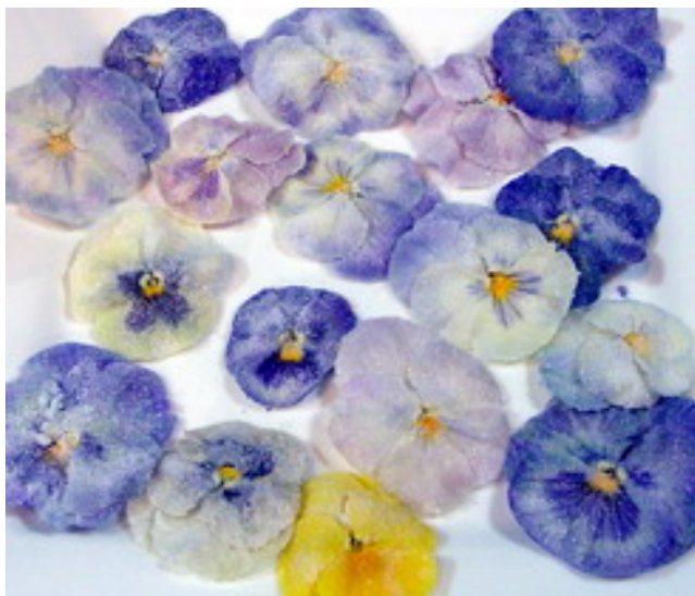
Candied Pansies Dean & Deluca