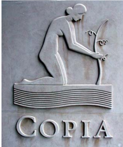
The American Center for Wine, Food, and the Arts

COPIA Located in the city of Napa on the banks of the Napa River. COPIA supplies a fun, interactive center where you investigate the fascinating cultural intersections of wine, food and the arts. Robert Mondavi first conceived the center and donated $20 Million to get it started. Enjoy tastings, classes, festivals, exhibitions and performances that engage your senses and enrich your life. COPIA offers something for everyone. Plan to spend an entire day at COPIA to stroll through the gardens, examine the exhibitions, enjoy the wine and food tastings, eat at the restaurant or the café, shop in Cornucopia and more!