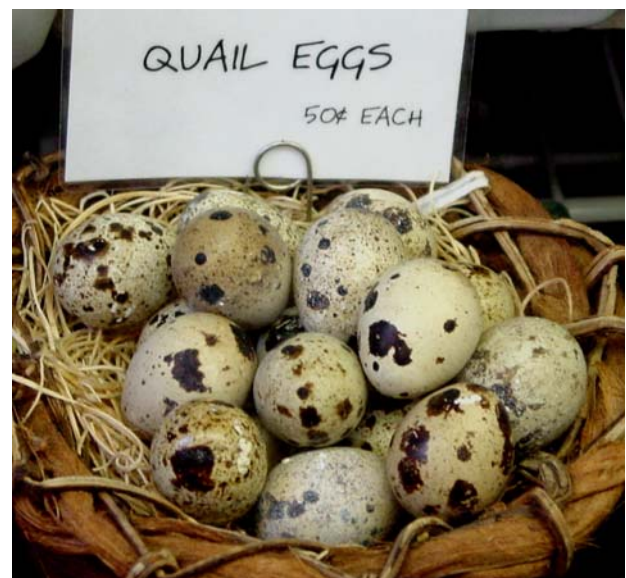
Quail Eggs Dean & DeLuca

Dean & DeLuca. At the South side of Saint Helena you'll find Dean & DeLuca. They offer a wonderful selection of Pinot Noirs including many hard to find ones. You'll also find an amazing array of food. I'm afraid my mouth gaped open as I wandered