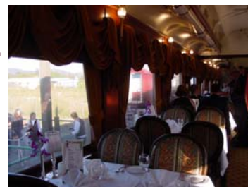
Napa Valley Wine Train

While dining at Terra we watched the Napa Valley Wine Train go by and decided to try that also. We enjoyed an evening of lovely food and wine aboard the circa 1915 Dining and Lounge Car. We first enjoyed dinner in the Dining car while traveling from Napa to Saint Helena. At Saint Helena we moved to the Lounge car and enjoyed the trip back to Napa with wine, coffee, and dessert.