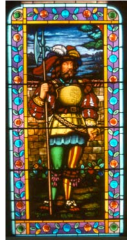
Beringer Stained Glass

The Napa Valley Vintners web-site contains an abundance of information on Napa Valley wineries and wines.