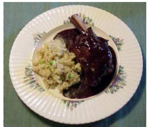
Lamb Shanks Braised in Pinot Noir with Wild Huckleberry Sauce

Many recipes using Pinot Noir are available at Patty's Pinot Closet Website .