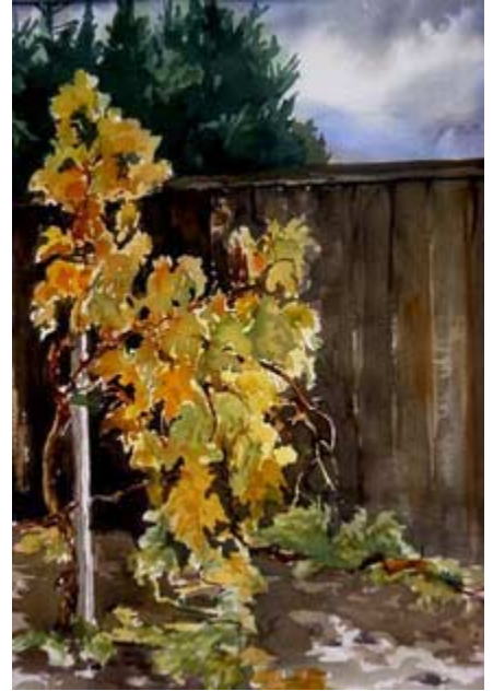
After the Harvest Watercolor 18 x 24 $425.00

I'm looking for artists whose work reflects the wine/vineyard environment to be represented on Patty's Pinot Closet Website. Please contact Jud .