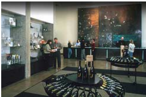
J Tasting Room

J Vineyards and Winery At J they believe that wine should be enjoyed with food - I agree. They offer their wines with a wonderful array of foods. A few of the foods they offer to go with their Pinot Noirs are Buffalo Chili and Crème Fraiche in House Made Tortillas, Five-Spice Barbeque Duck Dim Sum, and Smoked Duck Sausage with Herb Butter on Dijon Scone