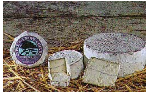
Cypress Grove's Humbolt Fog