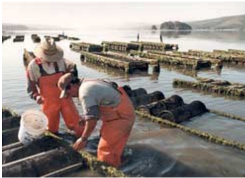
Hog Island Oysters

Oysters. On the edge of Sonoma County you will find The Hog Island Oyster Company on Tomales Bay, a National Marine Sanctuary. The San Francisco Chronicle named the Hog Island Sweetwater the "Best American Oyster" in a blind taste test. They grow and sell over 3 million oysters a year. Visitors are welcome Wednesday through Sunday and you can bring a picnic and enjoy some oysters. I've been known to eat as many as 36 in one sitting. I especially love them with a vinaigrette they call "Hog Wash". The "Hog Wash" recipe is available on their website and you can order oysters there as well.