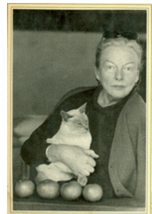
M. F. K. Fisher

When I think of Sonoma County and food I think of three things – goat cheese, Oysters, and white peaches.