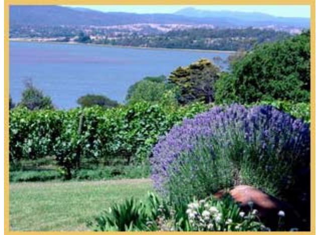
View from Daniel Alps at Strathlynn

They believe in genetically unmodified produce and the island abounds with orchard fruits and berries. They grow a wide variety of vegetables and herbs and in recent years a black truffle industry has started with truffieres near Launceston and Hobart.